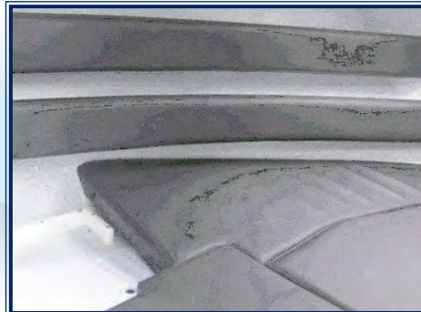
Cabin area is big enough for overnight stays and can be customised to suit your needs