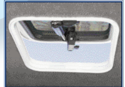
Roof hatch as standard increases air flow into the cabin