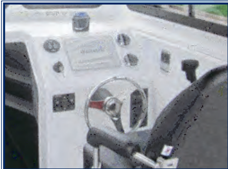
Large uncluttered dash easily accommodates large screen electronics

Boarding platform(s) Bow rail Bunk infill Clip-in carpet Companion seat Deluxe bait board Extra deck cleats Foam filling GME marine radio(s) Hull colour Larger fuel capacity Live bait tank Saltwater deck hose Ski pole Stainless rod rack from hard top Sterndrive Stress Free anchor winch Transom ladder Twin engines Walk-through transom